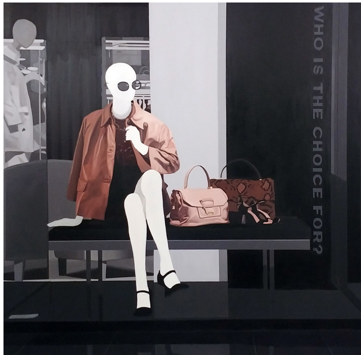
Forgetting – City Life 56, 2022

This work depicts a show window that was filmed at a large shopping mall in Beijing in 2018 as a material, and is expressed to ask the question 'who is the choice for?' about consumption, as the text in this work.