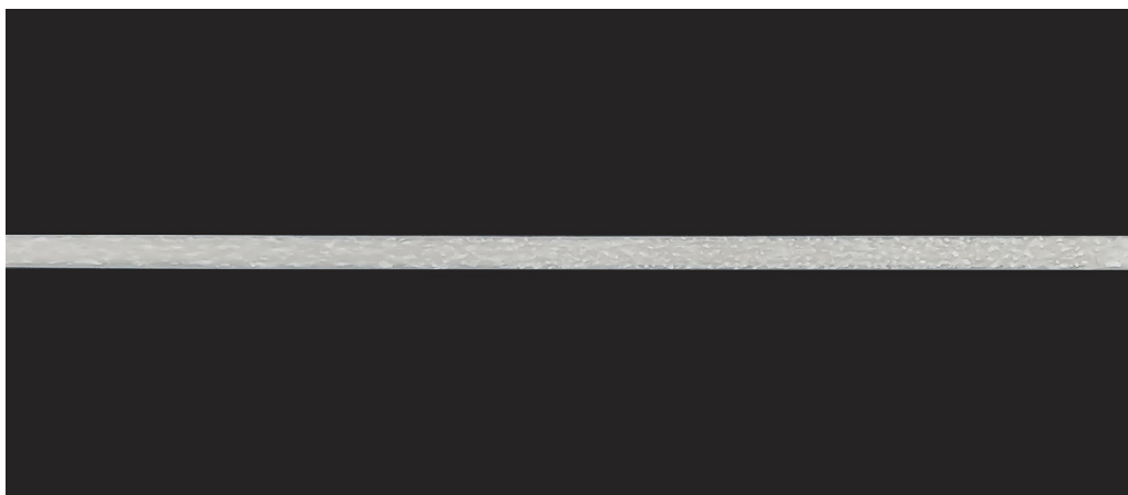
<Cognition – 13 The way of seeing, 2021>

This piece, related to 'Cognition – 12', represents that humans cannot pinpoint the true nature of the objects we see with only the visible lights humans can recognize.